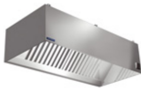
Grill hood open

Wall mounted hood in box form one-row/one-piece