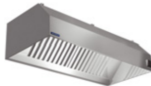
Grill hood closed

Wall mounted hood in trapezoidal form one-row/one-piece