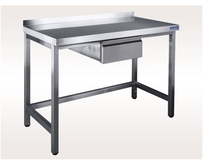
Work table with upstand, drawer and open substructure

Work table with upstand, support for GN containers and solid bottom shelf