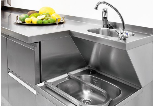
Hand-washing basin and sink combination