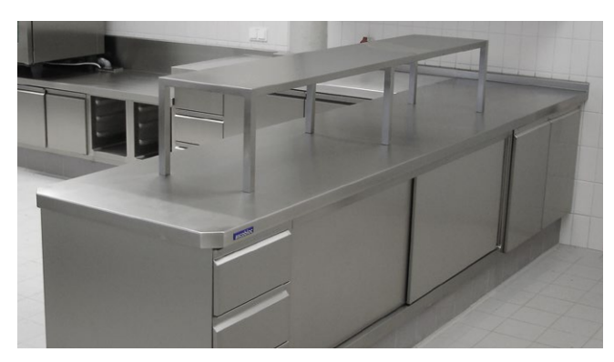
1-level bridge-type worktop shelf