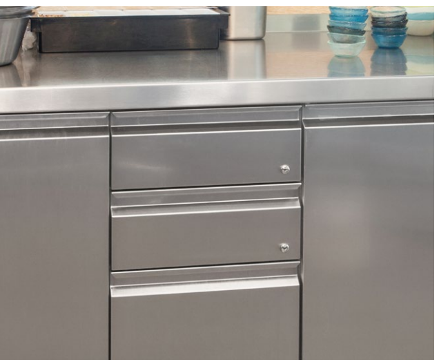
Drawers with safety lock