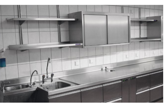
Wall-mounted 2-level shelf