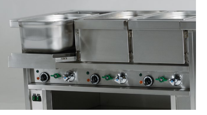
Hot service counter with flaps for front loading