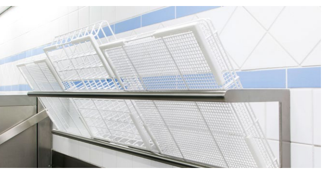
Inclined shelf for dishwasher baskets

Special versions of shelves and consoles