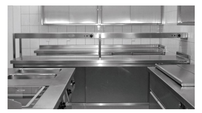
1-level heat bridge