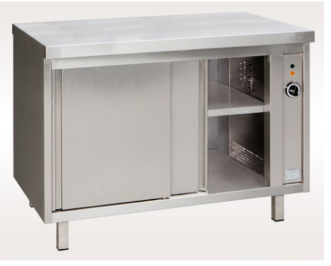
Warming cabinet – ventilated heating