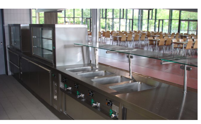
Hot service counter