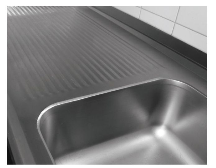
Seamlessly welded basin, with grooved draining board and bead edge Termination bar at rear upstand Worktop with discharge chute and rubber ring

CNS (AISI 304) dip container for serving utensils