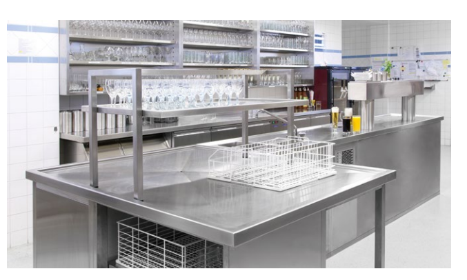
2-level shelf mounted on dish sorting table