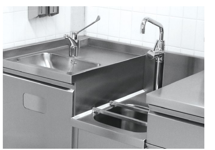
Hand-washing basin with lower cabinet with wing door