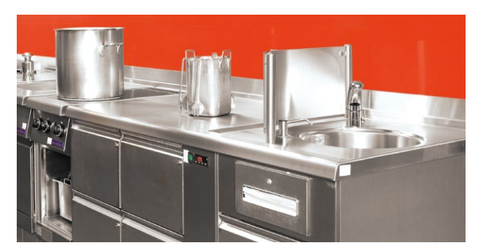
Hand-washing basin with splash guard and towel dispenser