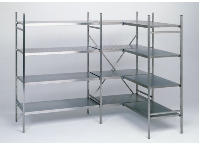
Stainless steel shelve-system - corner variant