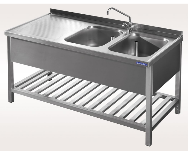
Sink unit with two basins and drainer, substructure with gride shelf